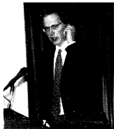
Bill Joy, chief scientist and co-founder of Sun Microsystems

For an awards ceremony, the evening tackled serious subjects.