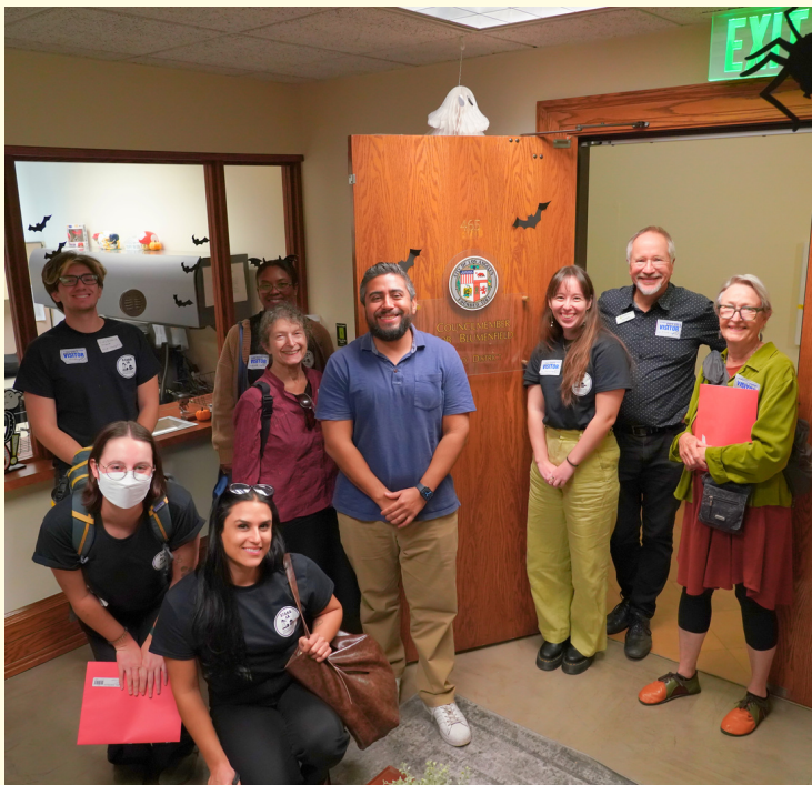
Top: STAND-LA members following an IOF hearing at the LA County Department of Regional Planning Commission

In 2022, the STAND-LA coalition achieved unprecedented milestones by securing commitments from the City and County of Los Angeles for a comprehensive oil and gas extraction phase-out. This year marked another significant triumph as the Los Angeles County Board of Supervisors approved an ordinance to gradually eliminate oil drilling activities from nearly all unincorporated areas of LA County. But progress does not stop there – the County is now preparing to enact a complementary, game-changing ordinance poised to halt operations at the Inglewood Oil Field (IOF), the largest urban oil field in the entire country.