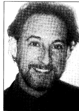
Harvey Karp, M.D.

California Department of Health Services, the California Medical Association and has lectured extensively on environmental risks to children. A contributing editor to the American Academy of Pediatrics' The Green Guide , Dr. Karp is writing revolutionary new book on colic, The Happiest Baby on the Block , to be published in June 2002 by Random House.